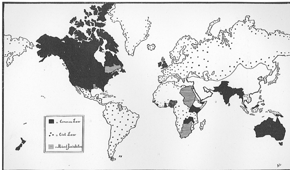
Figure 1: The Civil Law and the Common Law—A World Survey

Below is his map, partly written in his own hand, with his initials showing in the right hand corner.